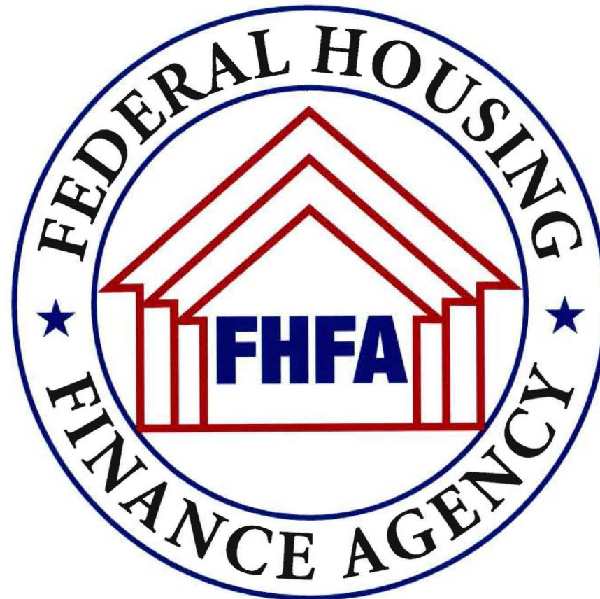
FHFA Logo 4 September 2008