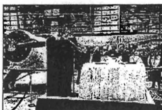
VIEW PHOTO Capstone Avionics Bill Address

LISTEN TO AUDIO Purple Heart Trail Bill Signing