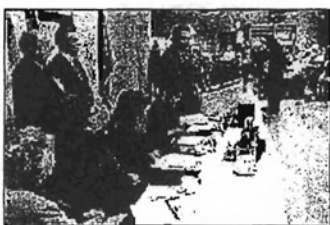
VIEW PHOTO Older Americans Month Event

LISTEN TO AUDIO Purple Heart Trail Bill Signing