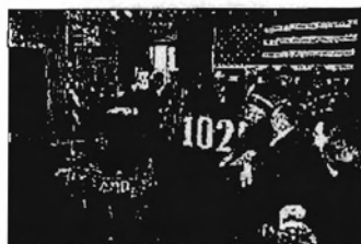
VIEW PHOTO Purple Heart Trail Address