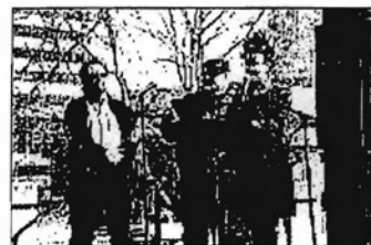
VIEW PHOTO Motorcycle Awareness Month

Governor Sarah Palin presented a proclamation to more than 600 bikers designating May 2008 as "Motorcycle Awareness Month" at the Anchorage Bike Blessing on May 3 in the downtown Park Strip. The proclamation said that in 80-90 percent of all accidents involving a motorcycle, it is the other motorist's fault and urged motorists to use caution when they are near motorcyclists. The Governor wished the bikers safe and happy rides.