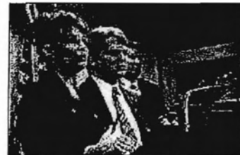
VIEW PHOTO Short-Term Energy Relief Plan

The Energy Debit Card will go out to every qualifying Permanent Fund Dividend applicant. The benefit will be $100 per month per PFD recipient the amount allocated for children's benefits will accrue to the card of the sponsor on their PFD application. Money not used on the card one month will carry over to the next month. It is expected that the amount available to individuals through the card will be considered income by the IRS. The temporary Energy Debit Card can be used for purchases from Alaska energy vendors, such as heating oil distributors, natural gas utilities, gas stations and other retail fueling stations.