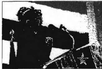
VIEW PHOTO Governor Welcomes Soldiers Home

Katie Tepass, Department of Public Safety