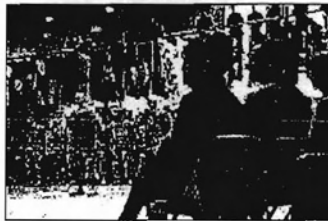
VIEW PHOTO Welcome Home Alaska ANG

the most dangerous deployment of the Alaska Army National Guard," the Governor told the troops. "Thank you for all that you have done, and for the sacrifices you and your families have made in order to secure our freedom and safety."