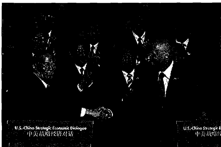
Treasury Secretary Henry M. Paulson Jr. greets Wang Qishan, China's vice premier, at the Strategic Economic Dialogue at the U.S. Naval Academy.

Washington Post Staff Writer Wednesday, June 18, 2008; Page D01