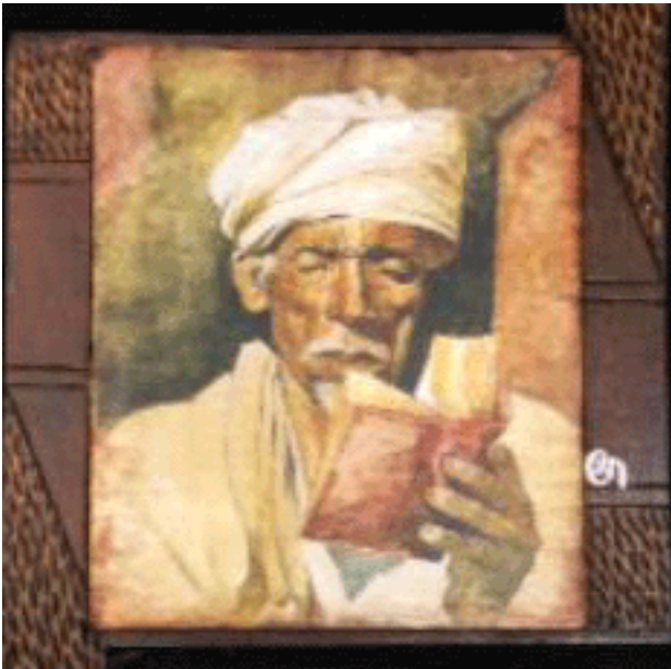
Painting of Ethiopian man