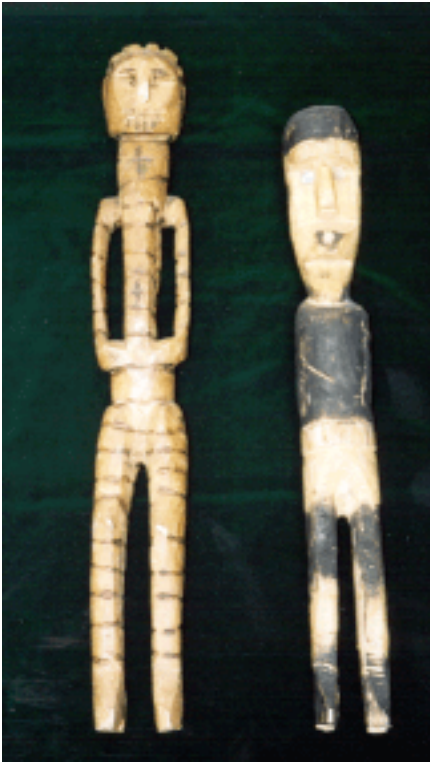
Totems from the Konso ethnic group.