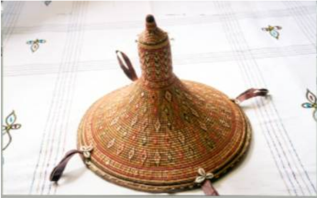
Basket from Harar