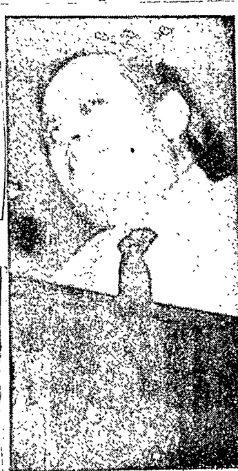
Thinking . . .

About his feelings on exposing the men personally involved in graft or corruption — "I think it is a very cruel thing when we expose another human being. . . I don't enjoy doing it, but when a public figure betrays the public trust, he should be exposed. . . they are things the American public has a right to know."