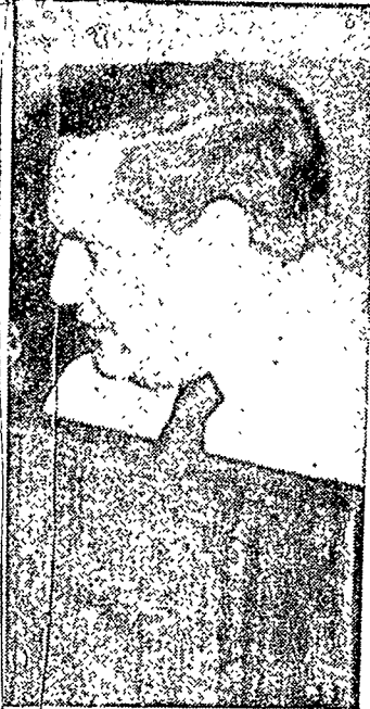
The Question . . .