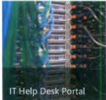
IT Help Desk Portal