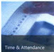
Time & Attendance