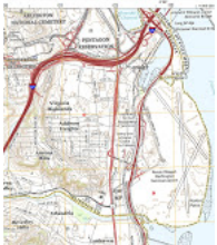
US Topo 2016.jpg 464K

At least the correction from civil to ppl is already in the public record. Glad to see something's working right today :-)