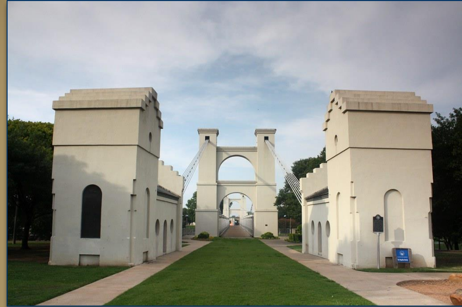
Waco Suspension Bridge, NR-listed in 1970. Photo taken August 13, 2009. Historic American Engineering Record survey HAER No. TX-13 as "Waco Suspension Bridge"