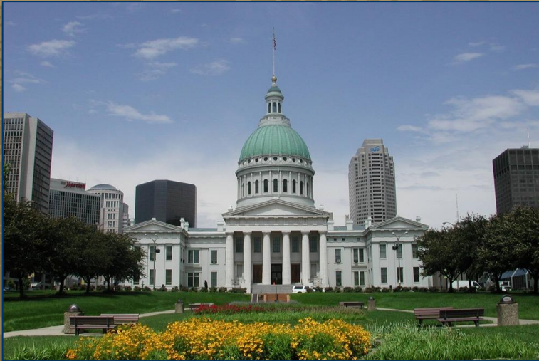
Old Courthouse, Jefferson National Expansion Memorial, Gateway National Arch

NPS mandate to identify, evaluate and recognize nationally significant historic properties