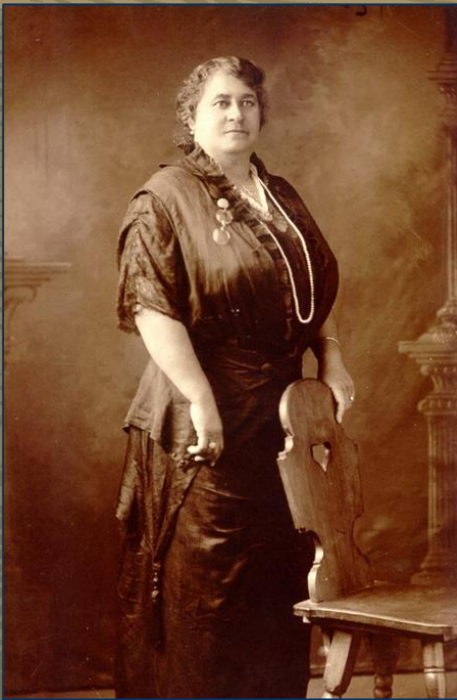
Maggie Lena Walker National Historic Site, VA