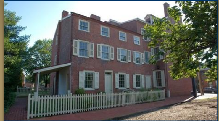
Edgar Allan Poe National Historic Site, PA