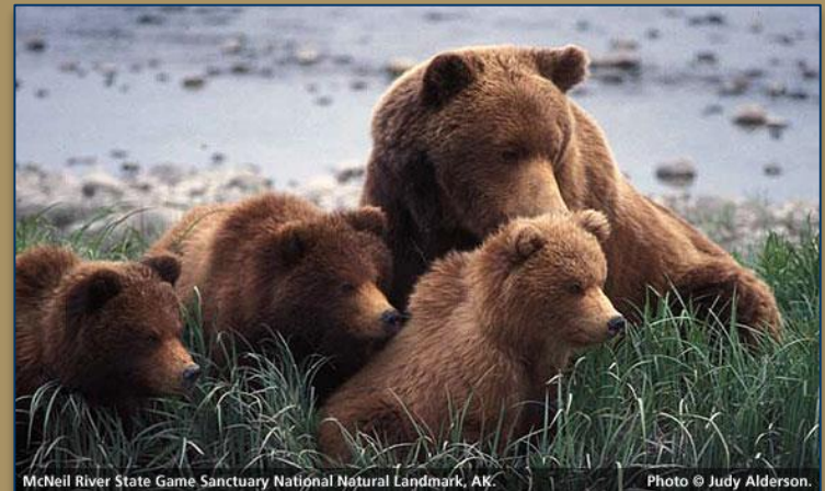
© Judy Alderson, 2004 1 st Place NNL Program Photo Contest Winner