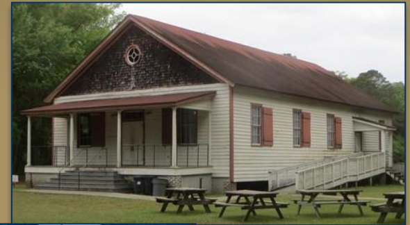
Reconstruction Era National Historical Park