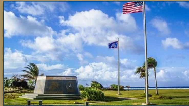
World War II in the Pacific National Historical Park, Guam