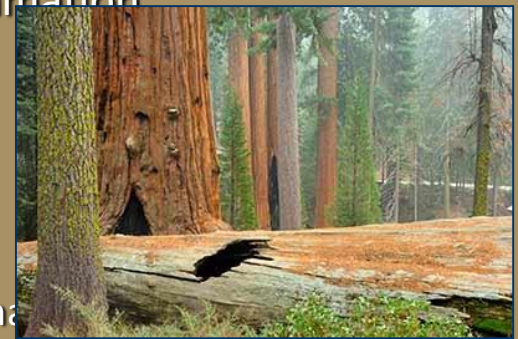
The Grant Tree Trail, Sequoia National Park