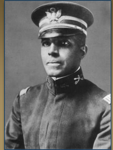
Col. Charles Young before his departure to Sequoia National Park in 1903.