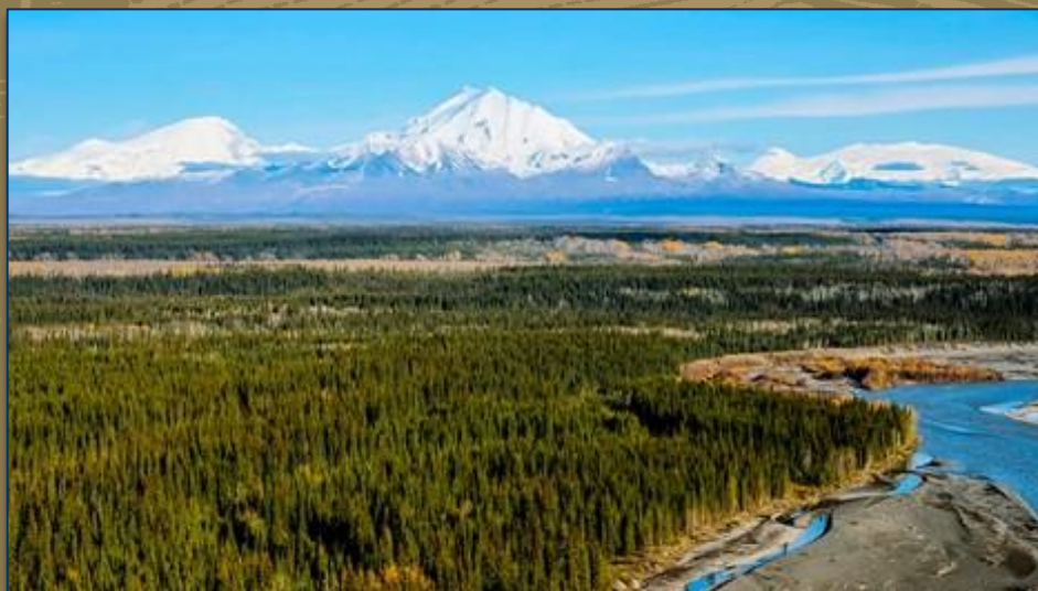
Wrangell-St. Elias National Park & Preserve, AK