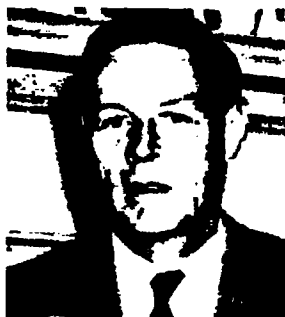
Charles E. ("Chip") Bohlen