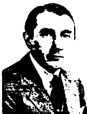
William H. Jackson