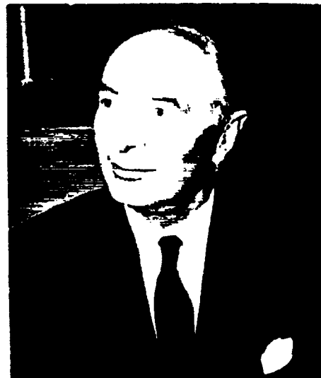
Robert Lovett, Secretary of Defense

With Lovett's memorandum, Canine acquired a new relationship with the military services and their COMINT activities. Theoretically, he now had control over all COMINT collection and production resources. Canine started a four-year term of office as the director of NSA on 4 November 1952. In accordance with its new charter, he received a third star. Each of the services assigned one or two two-star grade officers to the new agency. This change was consistent with Truman's decision to elevate the status of the unified agency. The reorganization of AFSA removed the COMINT structure from exclusive military control and theoretically gave all intelligence agencies, military and civilian, an equal voice in the COMINT processing and requirements process.