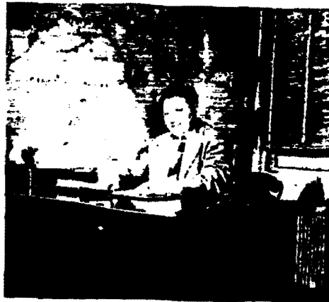
Dr. Solomon Kullback Chief, Research and Development Monitor Group