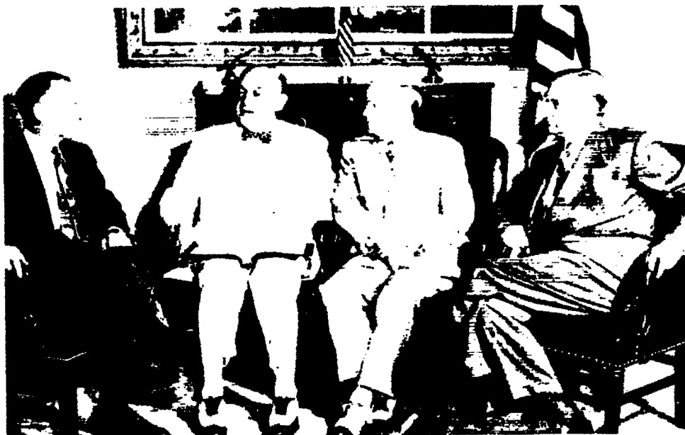
The Johnson Team

Thus, the atmosphere for cooperation and consolidation was volatile. However, by the time the vote on the AFSA merger took place, Johnson had appointed a new Secretary of the Navy, Francis P. Matthews, whom he had selected personally. 29 Matthews supported Johnson's position. As for the Air Force, Vandenberg, as Air Force Chief of Staff, had consistently and actively promoted the growth of the Air Force as an independent service. In addition to the commitment for an independent cryptologic arm for the Air Force, it is also likely that Vandenberg envisaged receiving greater financial support for aircraft programs if he went along with consolidation in other areas such as the merger of cryptologic activities.