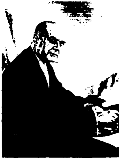
Louis A. Johnson, Secretary of Defense

Over the next three years the Air Force, as an independent service, had a major impact on the Army-Navy COMINT organizations. The establishment of the AFSS indicated that Air Force officials demanded a security service or cryptologic organization equal to the Army or the Navy COMINT structures. Competition for COMINT targets and resources intensified. Moreover, the three services now competed for recruitment of personnel to augment (or replace) the dwindling military competence in COMINT.