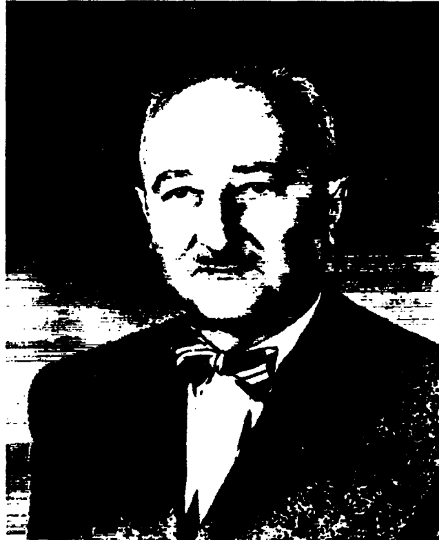
William F. Friedman