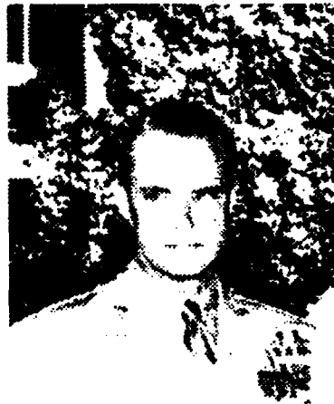
Lieutenant General Hoyt S. Vandenberg STANCIB Chairman

The COMINT organizations would coordinate their activities but would remain totally independent organizations. In addition to the integration of Army-Navy personnel on certain analytic problems, STANCIB divided the Army-Navy responsibility for [redacted] [redacted] targets along the traditional lines and identified the [redacted] communications as a "joint" responsibility, to be placed under the direction of the new Coordinator of Joint Operations. To implement this new concept of Army and Navy cooperation, STANCIB directed the Chiefs of ASA (Army Security Agency) and OP-20-G to draw up the details of a plan and statements of general principles governing the roles and responsibilities of the services and the Coordinator of Joint Operations. 23