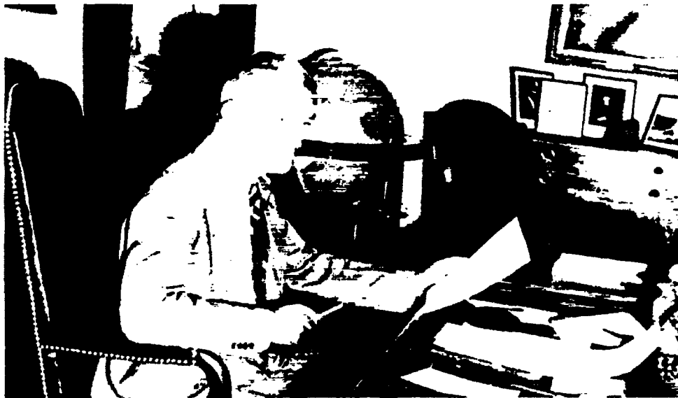
James V. Forrestal, First Secretary of Defense, 1947-1949