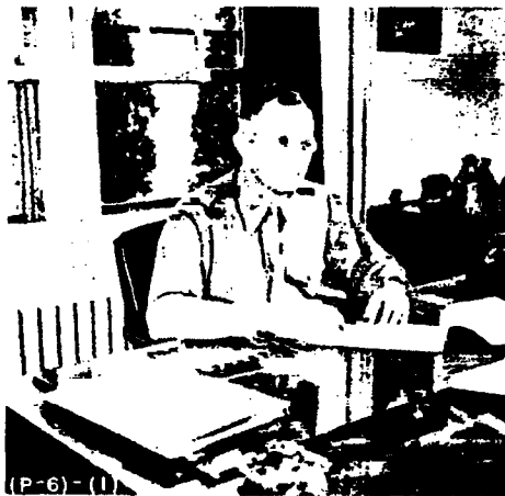
Colonel W. Preston Corderman, USA