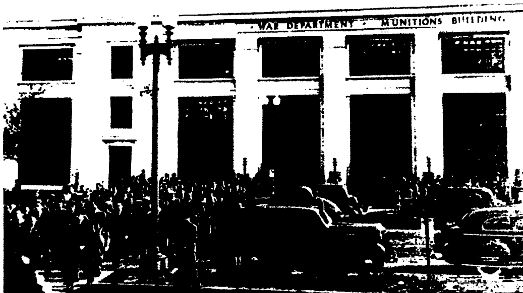
War Department Munitions Building

Leaving nothing to chance in their advance preparations, Army and Navy officials held a number of closed meetings prior to the meeting of the full committee. They sought primarily to resolve their long-standing disagreement on coverage of diplomatic targets. Five days before their meeting with the FBI, the Army and Navy succeeded in reaching an agreement on the division of COMINT responsibilities between their organizations. 21 The solution, urgently promoted backstage, resolved the nagging question of how to allocate service responsibility for diplomatic traffic. At the Navy's request, on 25 June 1942 the Army-Navy participants agreed to transfer the entire diplomatic problem to the Army for the duration of the war.