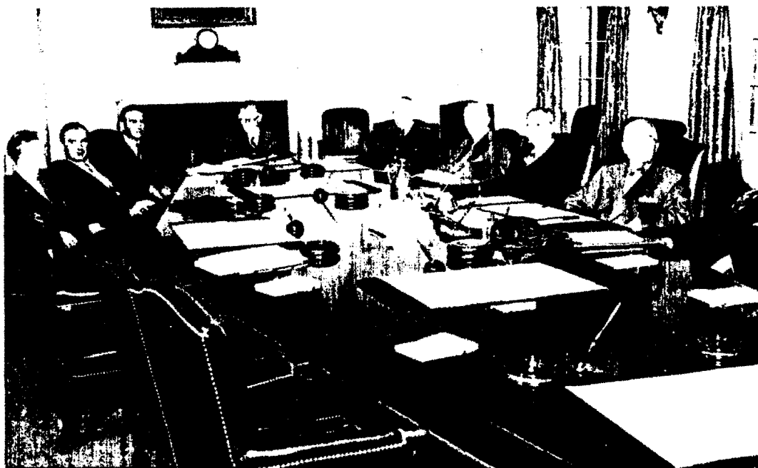
Meeting of the National Security Council, January 1961