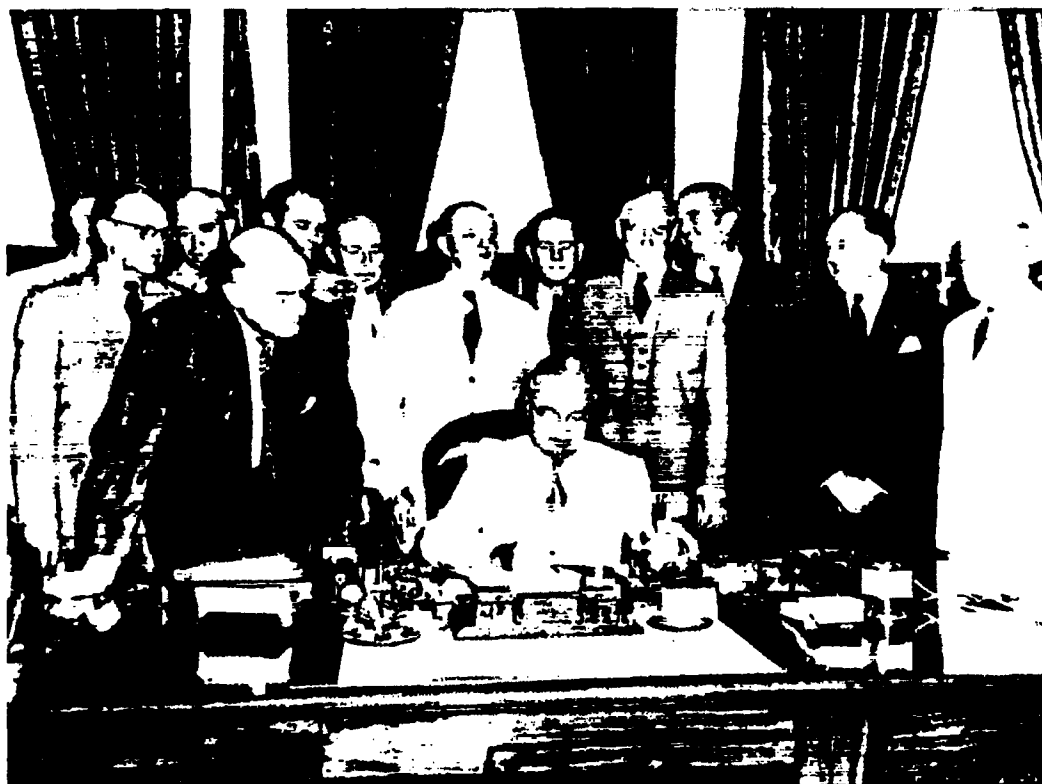
President Truman signing amendments to the National Security Act of 1947

president, the Secretary of State (Dean G. Acheson), Secretary of Defense (James V. Forrestal), and the chairman, National Resources Board. Optional attendees, depending upon the subject matter, were the secretaries and under secretaries of other executive departments and the military departments, the chairman of the Munitions Board, and the chairman, Research and Development Board. 17 The initial membership of the NSC did not include the DCI.