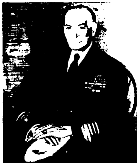
Admiral Roscoe H. Hillenkoetter Director of Central Intelligence