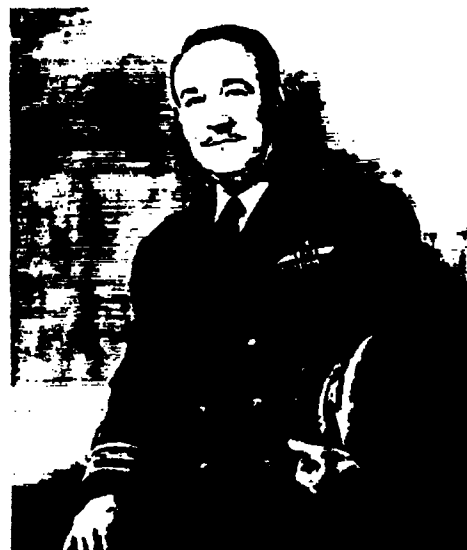
Admiral Sidney W. Souers Executive Secretary, NSC