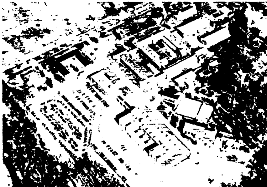
Aerial view of Navy Headquarters at Nebraska Avenue, March 1949