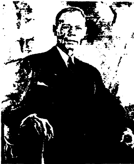
General Walter Bedell Smith, DCI