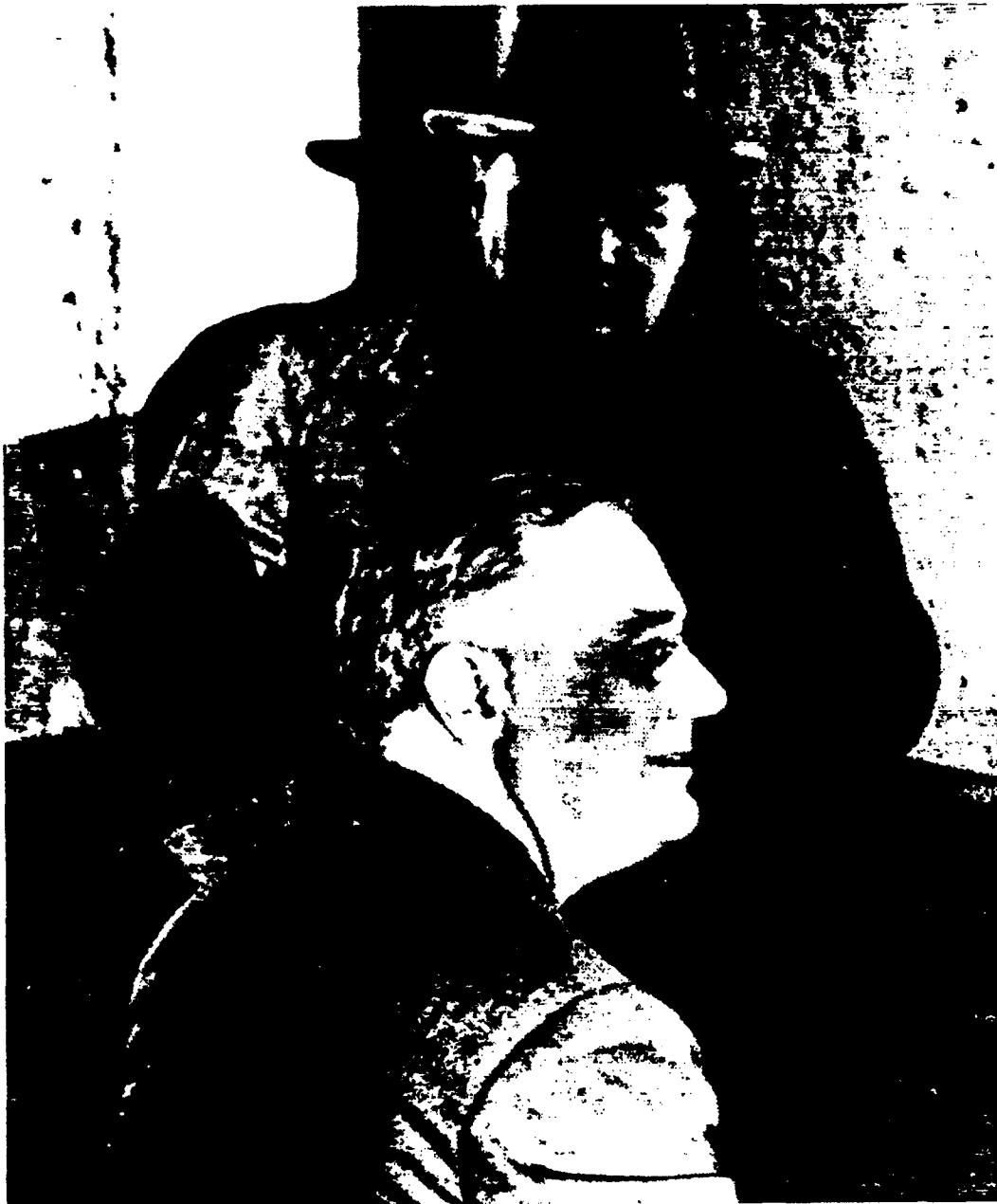
Franklin D. Roosevelt and Winston Churchill established a direct channel of personal communications in 1940, reinforcing strong ties between the United States and Great Britain.