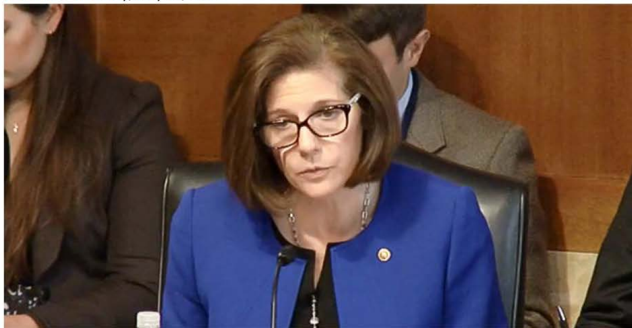
Sen. Catherine Cortez Masto (D-Nev.) during a hearing yesterday. Senate Energy and Natural Resources Committee

Senators from both parties railed against the Trump administration's proposal to sell federal grid assets and insisted investments are needed to curb climate change.