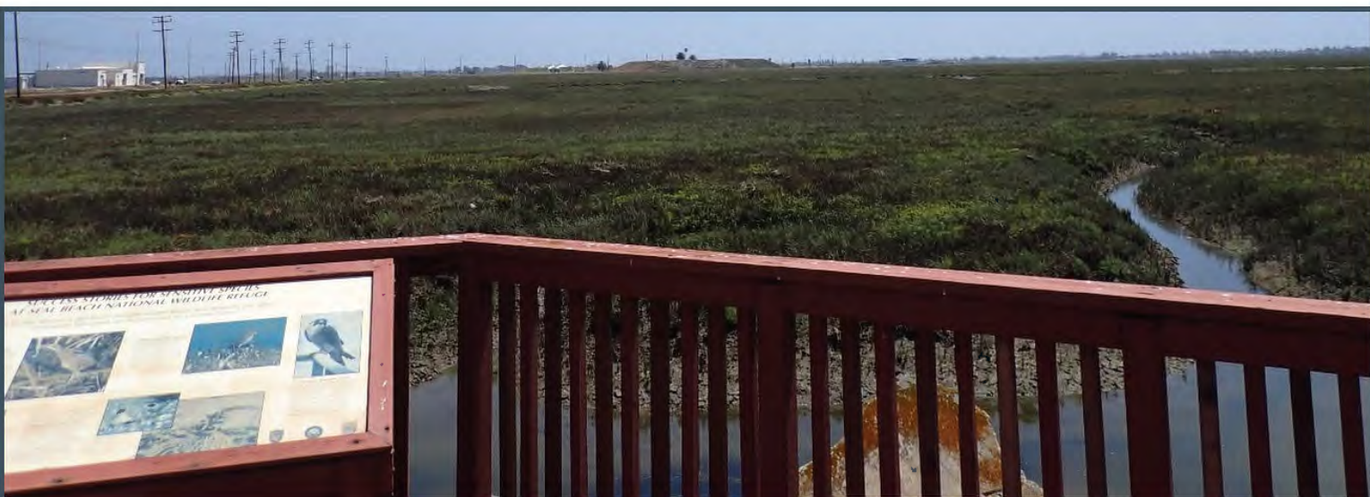
Seal Beach – Wildlife Refuge, 2022

encompasses approximately 5,256 acres of land with the Seal Beach National Wildlife Refuge occupying about 920 acres. Land-uses include ordnance storage and maintenance facilities; agricultural out-leases (used as buffer lands); Seal Beach National Wildlife Refuge; public-private venture housing; officers’ quarters and bachelor enlisted quarters; administrative and support areas; navy golf course; Defense Fuel Support Point San Pedro; and the wharf.