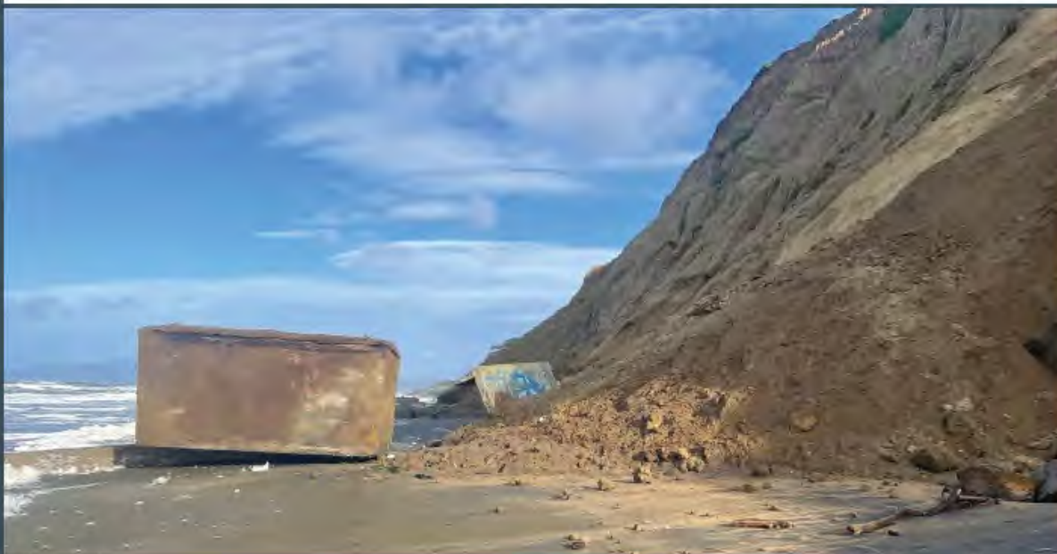
A World War II bunker tumbled down a cliff on California beach, 2022