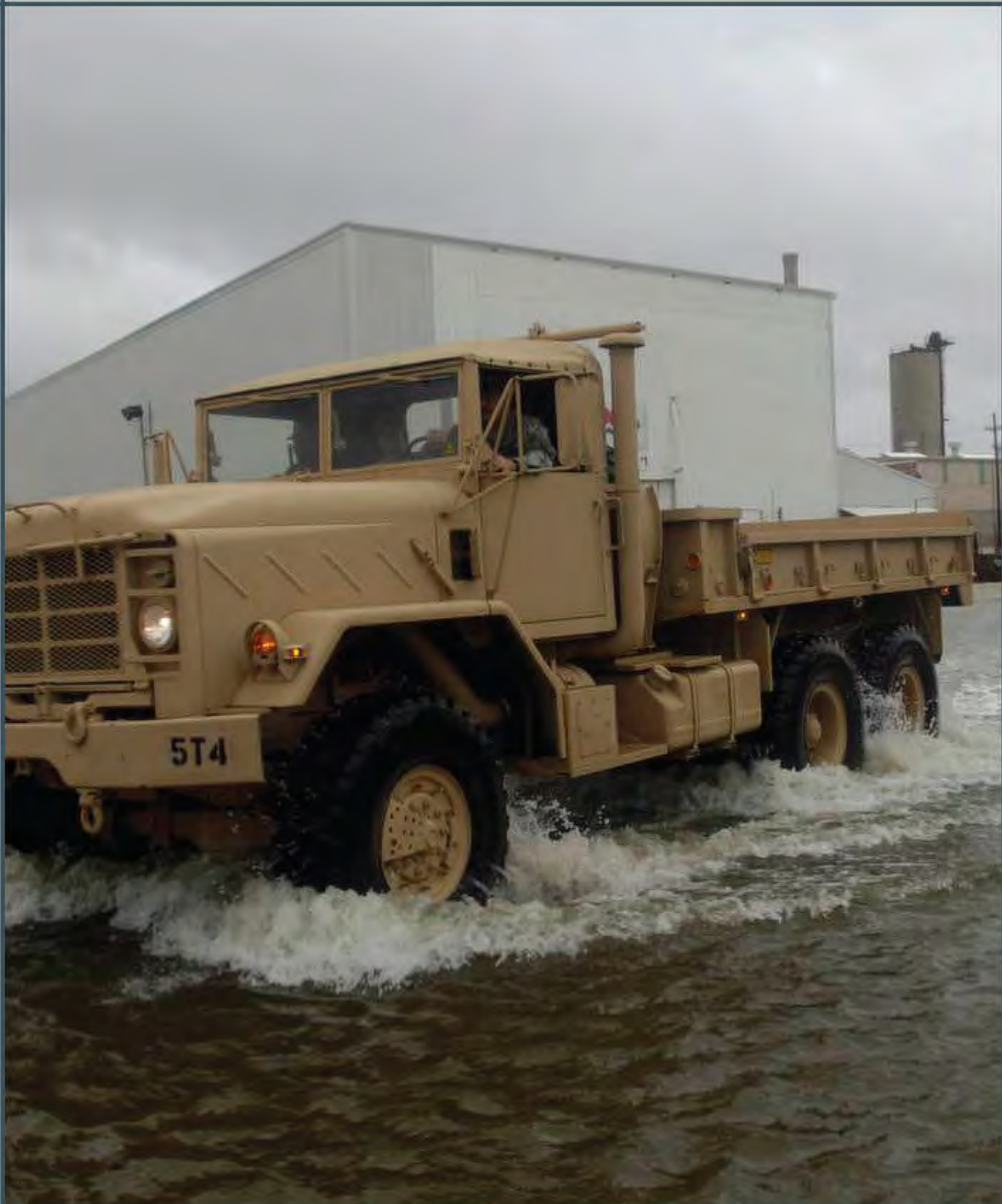
Louisiana National Guard troops drive through floodwaters from the industrial canal as Hurricane Gustav strikes the Gulf Coast on Sept. 1, 2008