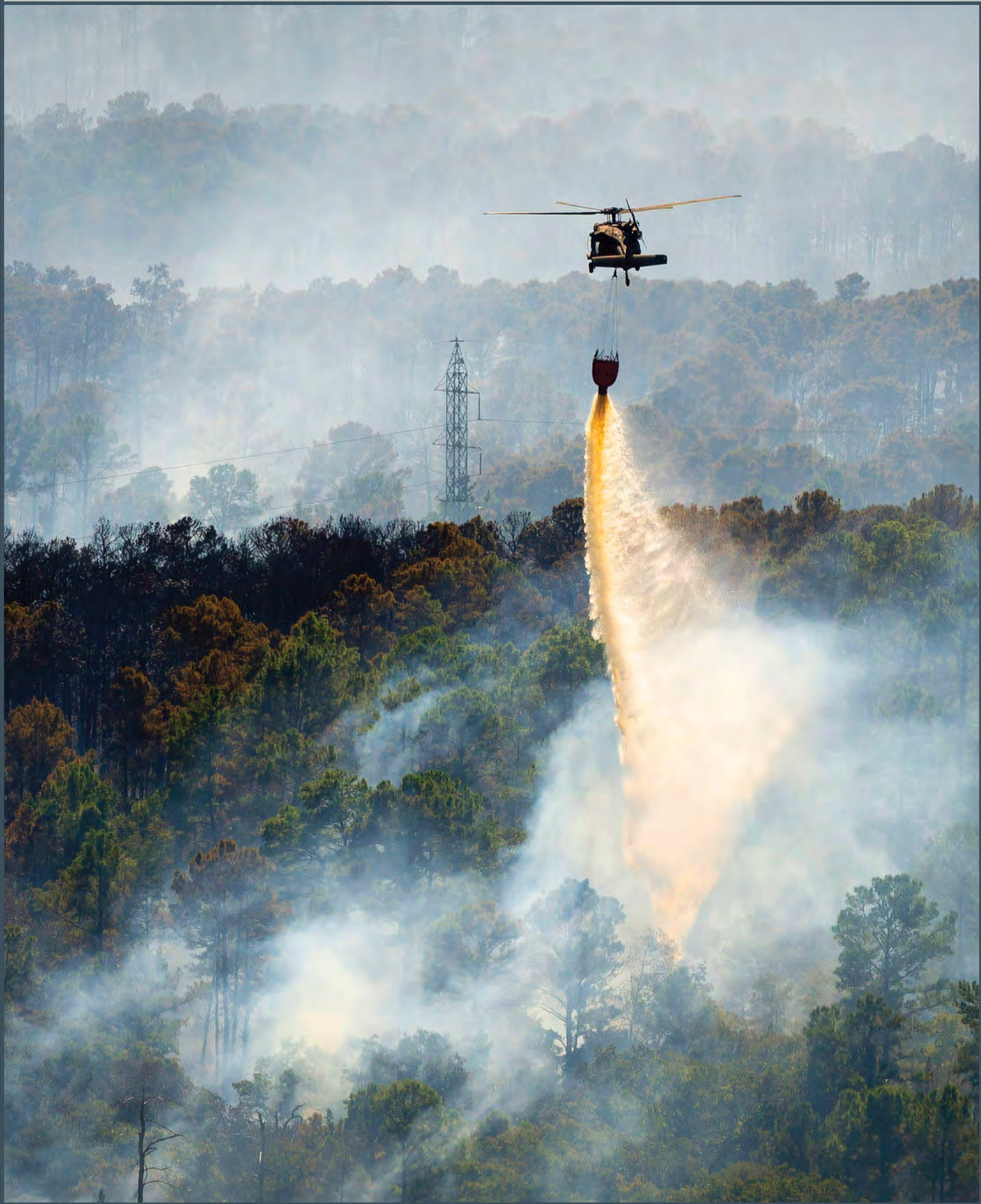
A helicopter drops flame retardant onto a forest fire, date unknown