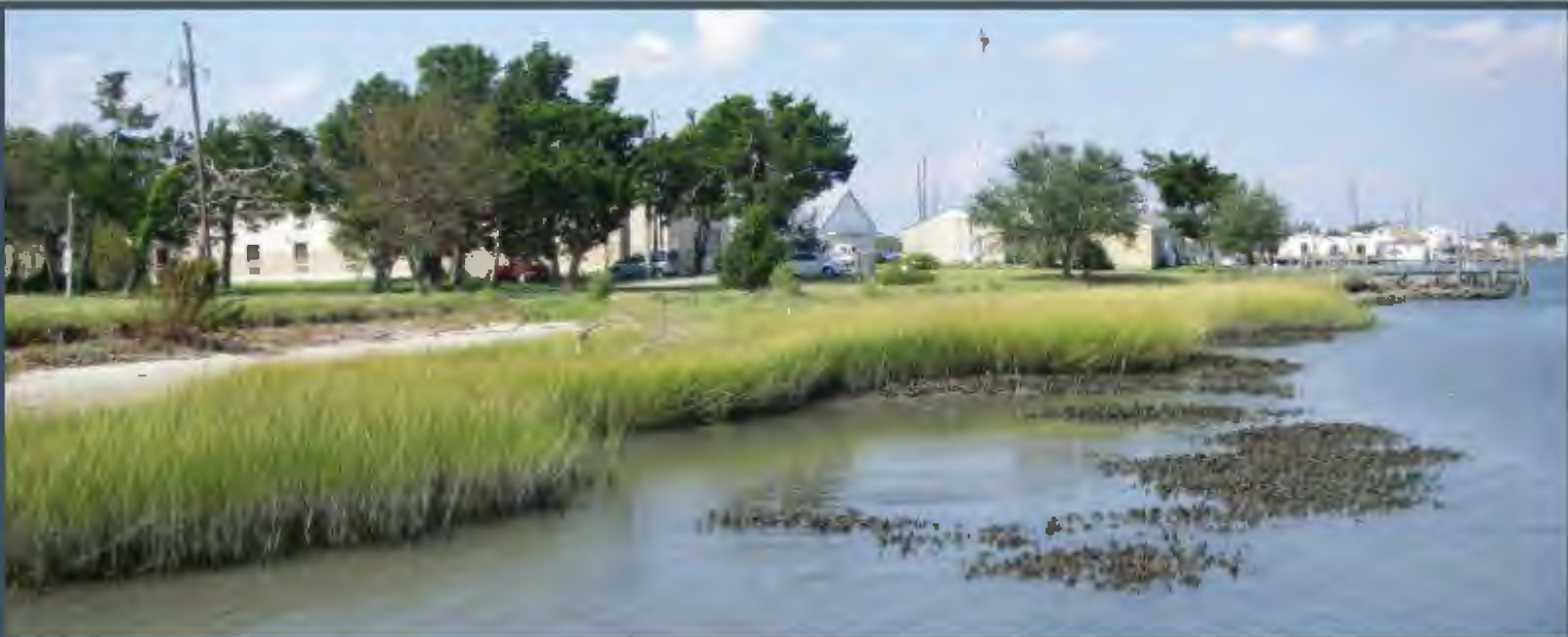
Living shoreline in Beaufort, NC, 2012