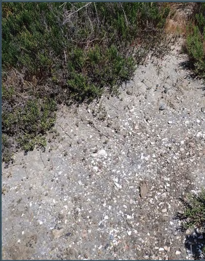
Seal Beach – shell midden, 2022

Navy Weapons Station Seal Beach has six archaeological sites that are eligible or recommended as eligible for the NRHP. The prehistoric sites comprise shell middens, lithic scatters, and shell and lithic scatters. One site, CA-ORA 1502 is an artifact scatter with human remains.