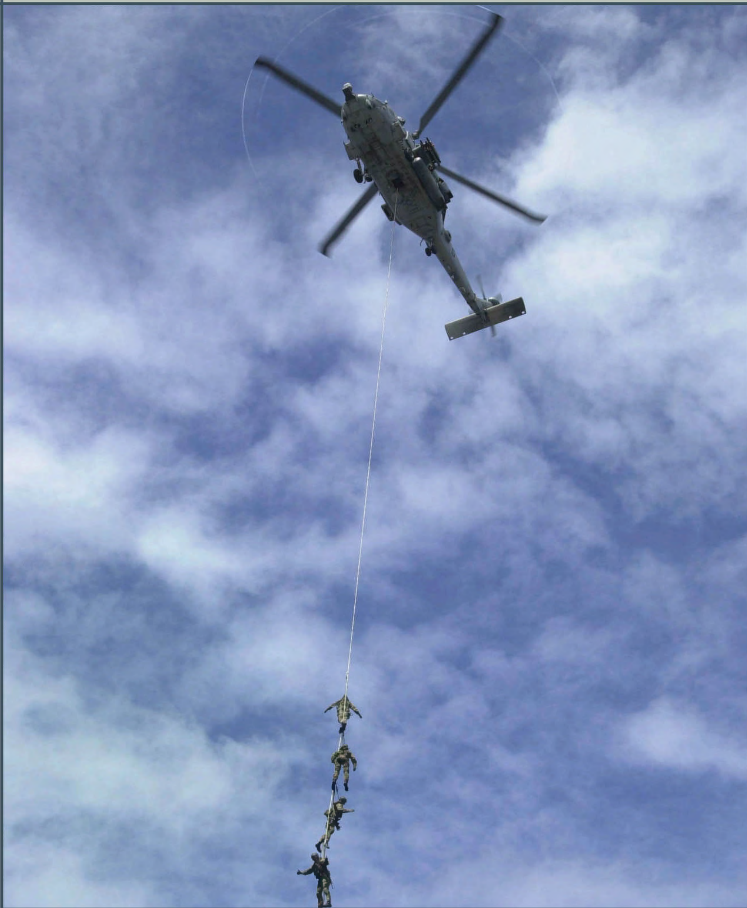
A UH-60 Blackhawk helicopter hoists a team of Soldiers during special training, date unknown