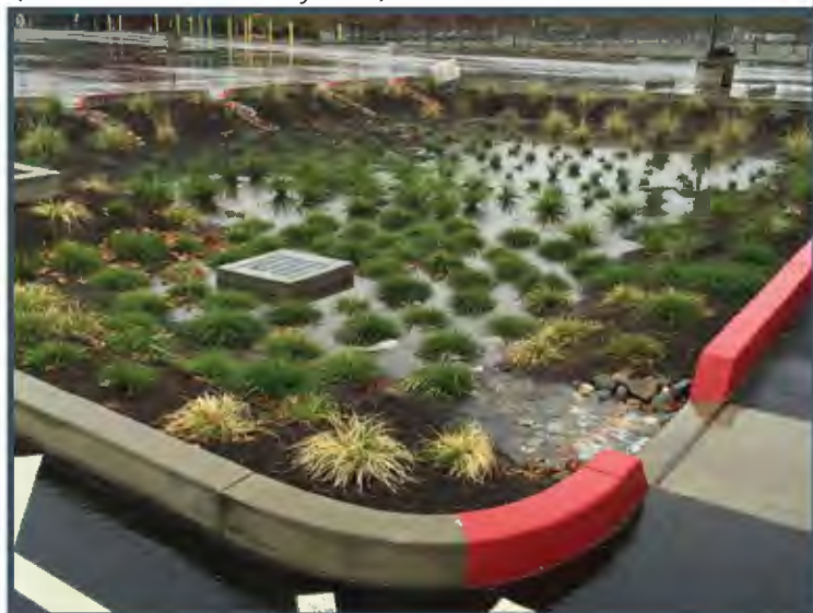
Bioretention planter, Sacramento, CA, 2016