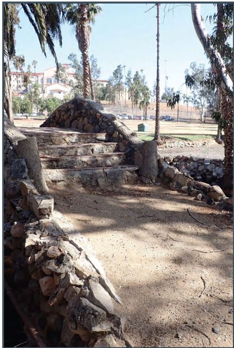
Det Norco – landscape elements, 2022