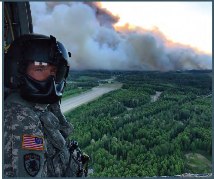
Wildfire, Fort Carson, 2017

The built infrastructure required to support military missions on DoD installations is extensive. Built facilities include airfields, port facilities, and support infrastructure comparable to small cities, including commercial buildings, medical facilities, public safety facilities, housing, communication networks, roads, bridges, railways, and supporting utilities (e.g., power, water, sewer). In addition, most installations