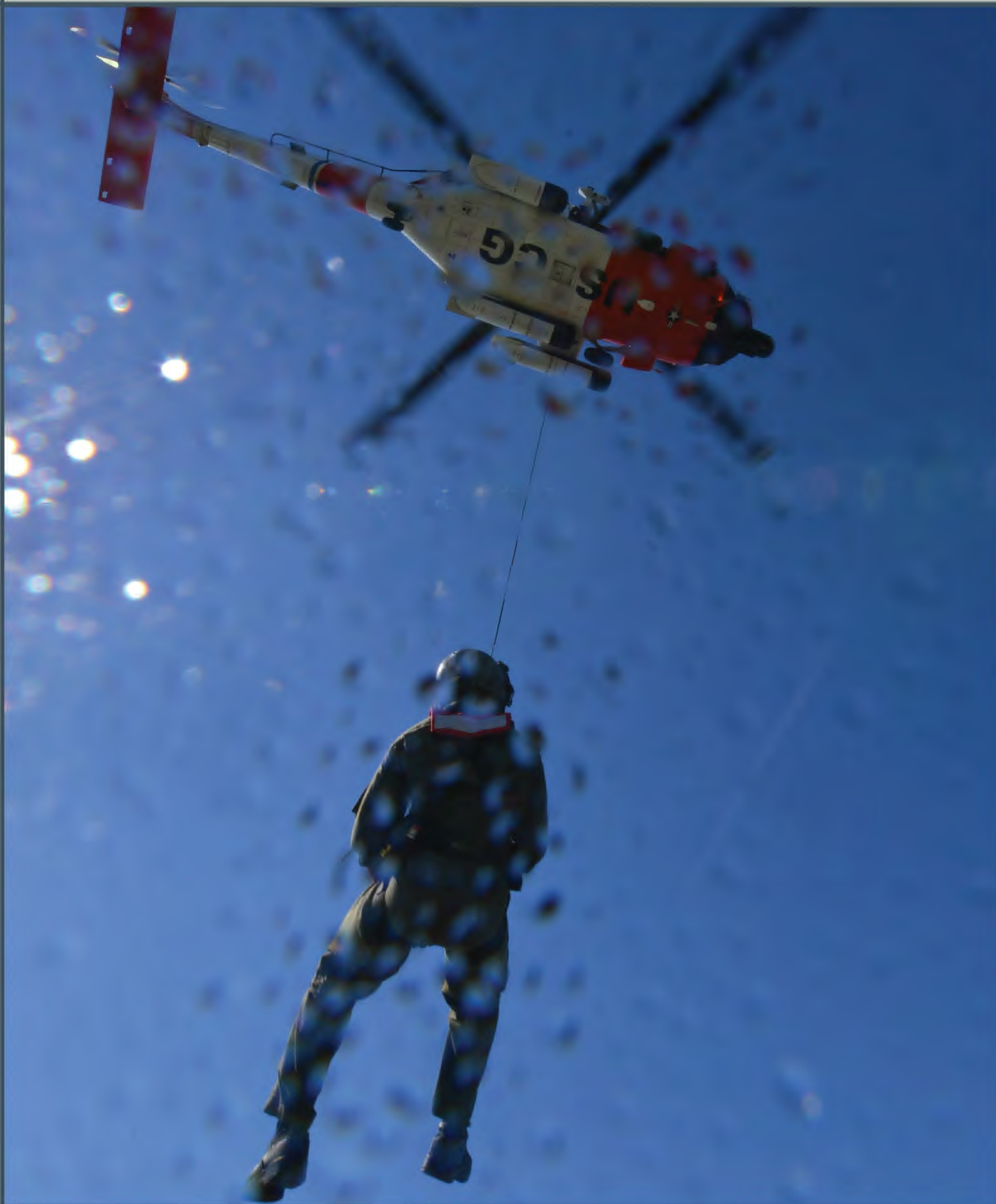
U.S. Army and U.S. Coast Guard train for emergency evacuation at Fort Eustis, 2015