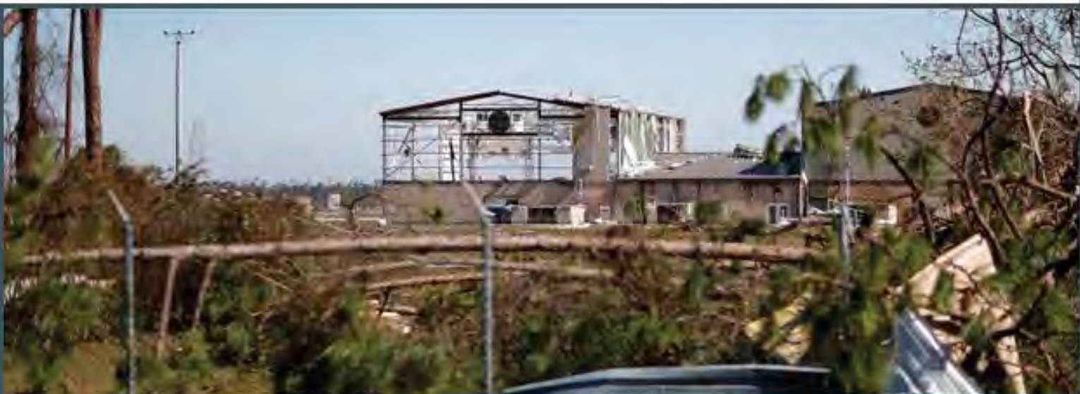
An airplane hangar at Tyndall Air Force Base is damaged from Hurricane Michael in Panama City, Florida on October 11, 2018

The installations and land managed by DoD are integral to the military's mission of keeping our nation secure. As such, there is an operational need to ensure that current and future climatic changes do not compromise the ability of installations to serve their essential operational, training, and testing functions. Even though extreme weather events and divergent climatic patterns are affecting DoD installations, the DoD has a responsibility for cultural resource stewardship. There are numerous statutes, regulations, or other DoD guidance that set out the cultural resources management responsibilities of DoD installations (see Chapter 3). The DoD manages several types of cultural resources, including historic buildings and structures, archeological resources and sites, objects, historic districts and landscapes, ethnographic resources, sacred sites, and burial sites. The built infrastructure required