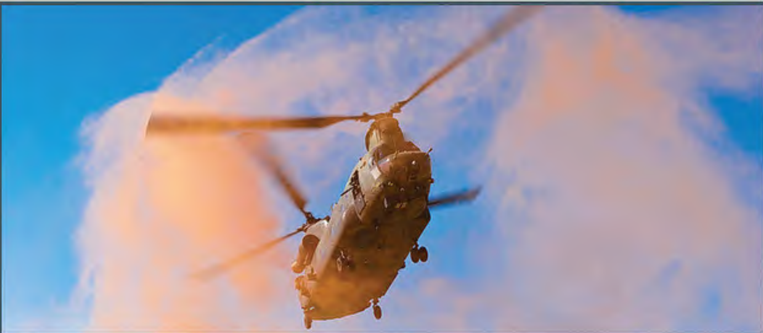
Effects to aircraft, 2011

also significantly increase the opportunity for vector-borne diseases: higher winter temperatures reduce winter vector mortality rates, while higher spring-fall temperatures extend the length of the breeding season, allowing for multiple reproductive cycles (Pinson. et al. 2021).