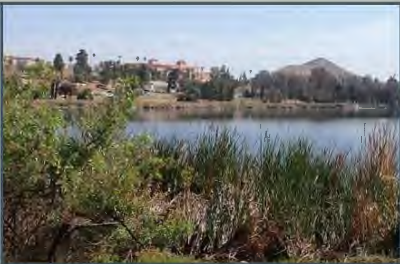
Det Norco – Building 201, casino/pavilion across Lake Norconian, 2022

to rehabilitate buildings 201 and 209 as funds become available.