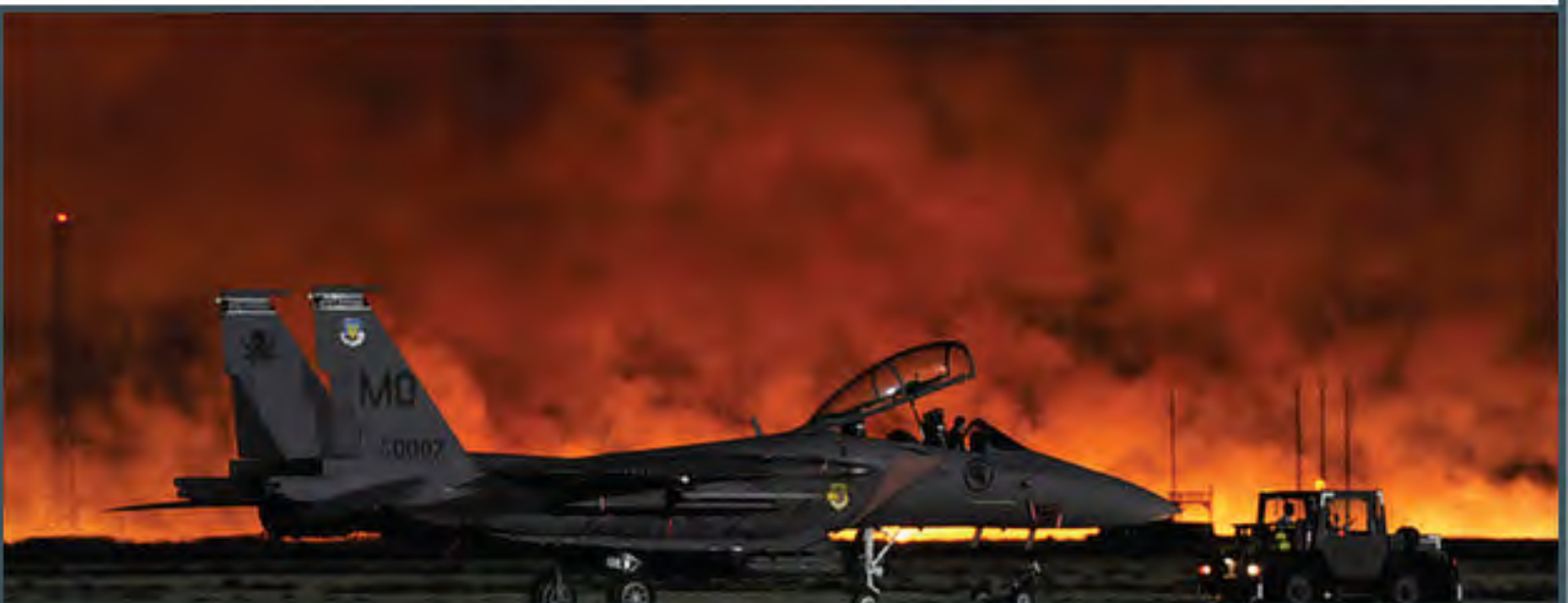
Wildfire, 2011

A result of drought is the increased chance and severity of wildfires. Wildfires are