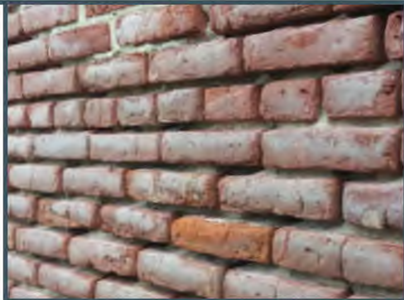
Effects of Hurricane Sandy on masonry in Crisfield, Maryland, 2012

Archeological sites may be located anywhere where there has been previous human occupation on the ground surface or buried below the surface. Archeological resources are incredibly diverse; examples include a small scatter of prehistoric stone or bone tools or historic metal cans, town sites, temples, fishponds, road system complexes, shell middens, and buried evidence of occupation. Climate change threats on archeological resources can take many forms, including erosion, inundation, and chemical alteration. Erosion can be exacerbated by changes in water supply, such as increases in rainfall overall or the intensity of individual rainfall events; by drought; and by additional