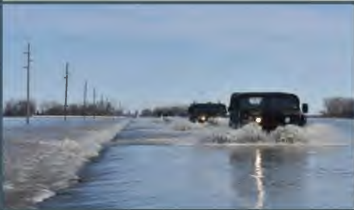
Minnesota Army National Guard Responds to Flooding, 2019

standards and building or retrofitting of energy-efficient construction will be an increasing priority for the DoD (DA 2013).