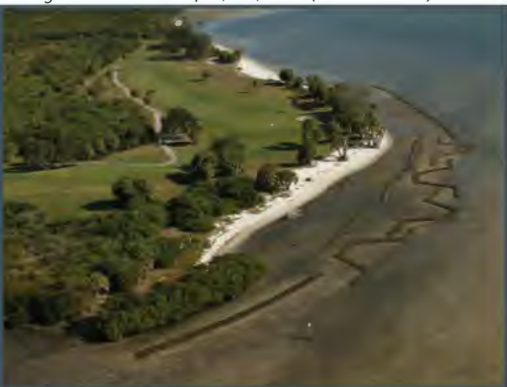
MacDill oyster reef stabilization, 2008