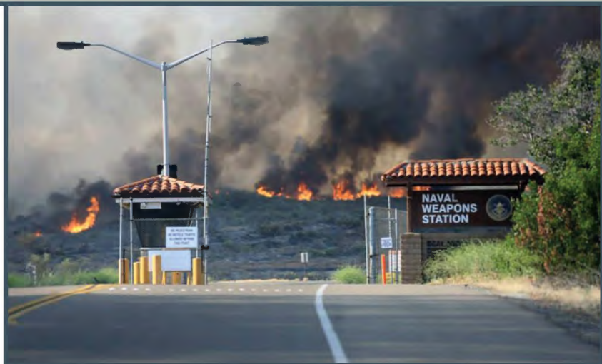
Fire around Naval Weapons Station Fallbrook, 2014

Climate concerns for Det Fallbrook include drought and increase severity of storms resulting in erosion. Although the drought has resulted in increased fire threats (fire frequency in the area has increased in the past 5 to 10 years), due to the type of archaeological sites (milling sites), the sites are generally not affected by fire; however, increased fire can increase erosion. The soils at the installation are very erodible. Critical roads and access could be damaged due to erosion. Grazing is the primary way the detachment reduces wildfire fuels which can be extensive over the property.