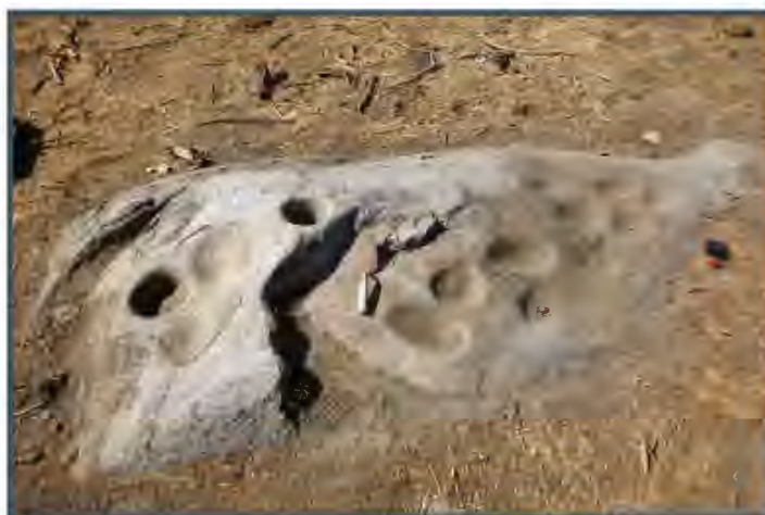
A bedrock milling feature, date unknown

The 326 buildings and structures that have been evaluated, were determined not eligible for the NRHP. Det Fallbrook has 127 known archeological sites. Four archaeological sites have been determined or recommended NRHP-eligible, eight sites are recommended as not eligible for the NRHP, and 115 sites have not been evaluated. The sites are located throughout the installation, and most are not impacted by or do not impact the mission. Two sites, CA-SDI-15133 and CA-SDI-158, are located in areas that are critical to the mission. One site, CA-SDI-15133, is the largest site and crosses a main transportation artery. The other site, CA-SDI-15133, is near the missile maintenance and storage facilities.