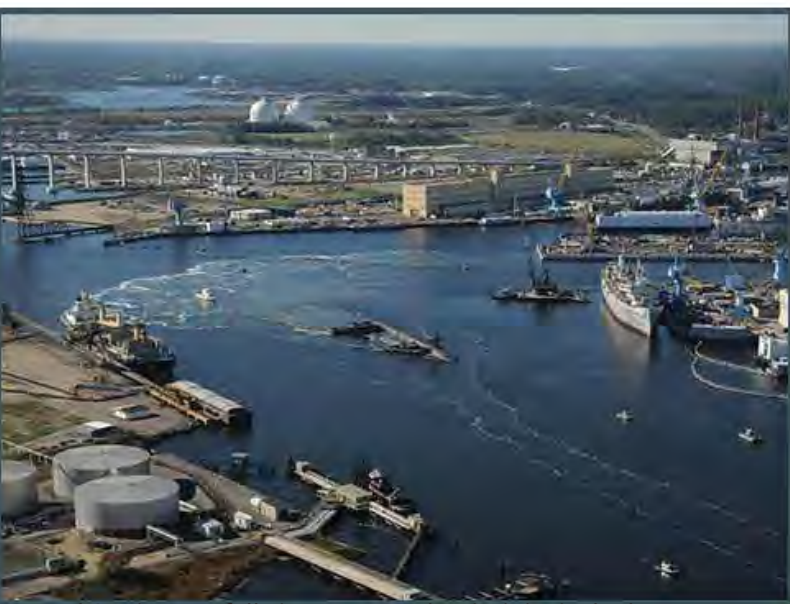
Naval Station Norfolk, in Portsmouth, Virginia, is the largest naval base in the world, 2017

In addition to damaging infrastructure, equipment, materiel, vehicles and aircraft, floodwaters may disrupt access to and from installations; cause utility closure; contribute to land degradation; impact training and