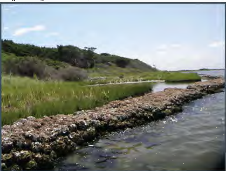
Living shoreline using oyster shells, Ocracoke, NC, 2016