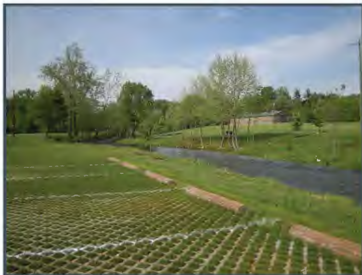
Permeable paver parking lot on greenway, Luray, VA, 2017