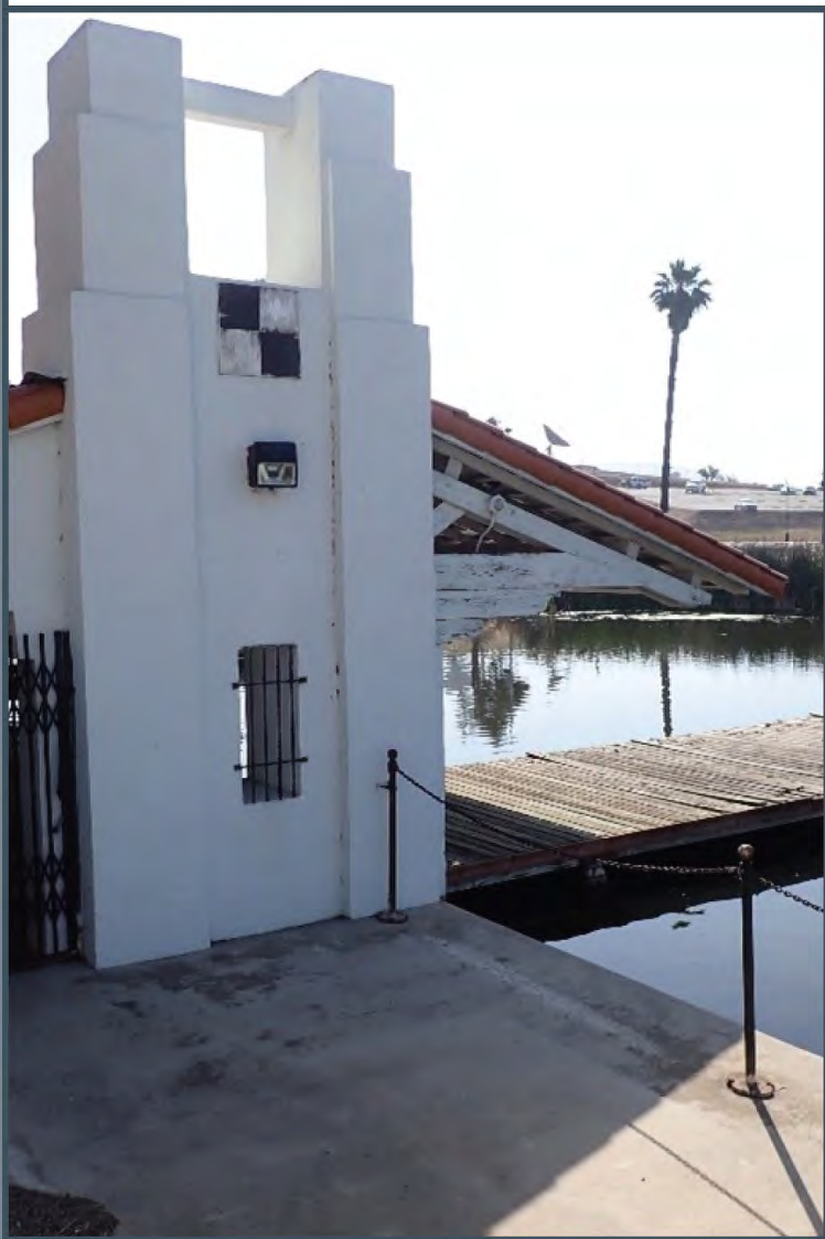
Det Norco – Building 203, boat house and dock, 2022