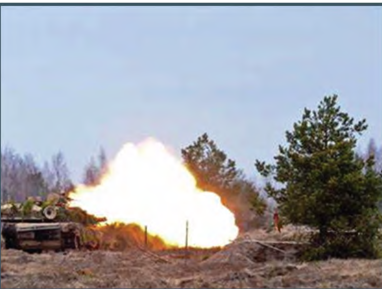
Live Fire Exercise, Sockeye Wildlife, 2015

Sea level rise and increased storm surge is expected to alter harbor topography, bathymetry, currents, and salinity, which may impact access to ports. Logistical support activities for military contingency operations are dependent on reliable access to port facilities. The land-based elevation of some installations is largely at or just above sea level. Coastal installations and facilities, if not subject to some level of inundation, would also be subject to increased groundwater salinity, a higher water table, and increased frequency of periodic flooding. These effects would require increased stormwater pumping and drainage capacity, maintenance for corrosion control, and flood protection. Increased temperature and precipitation can raise maintenance costs for vehicles and aircraft due to corrosion effects and impacts of ambient weather conditions on delicate electronic systems. Anticipated increases in cooling degree days and/or anticipated decreases in heating degree days would also alter energy usage. Generally, the change in cooling degree days is expected to be greater than the change in heating degree days, which could result in increased direct costs. Implementation of energy conservation