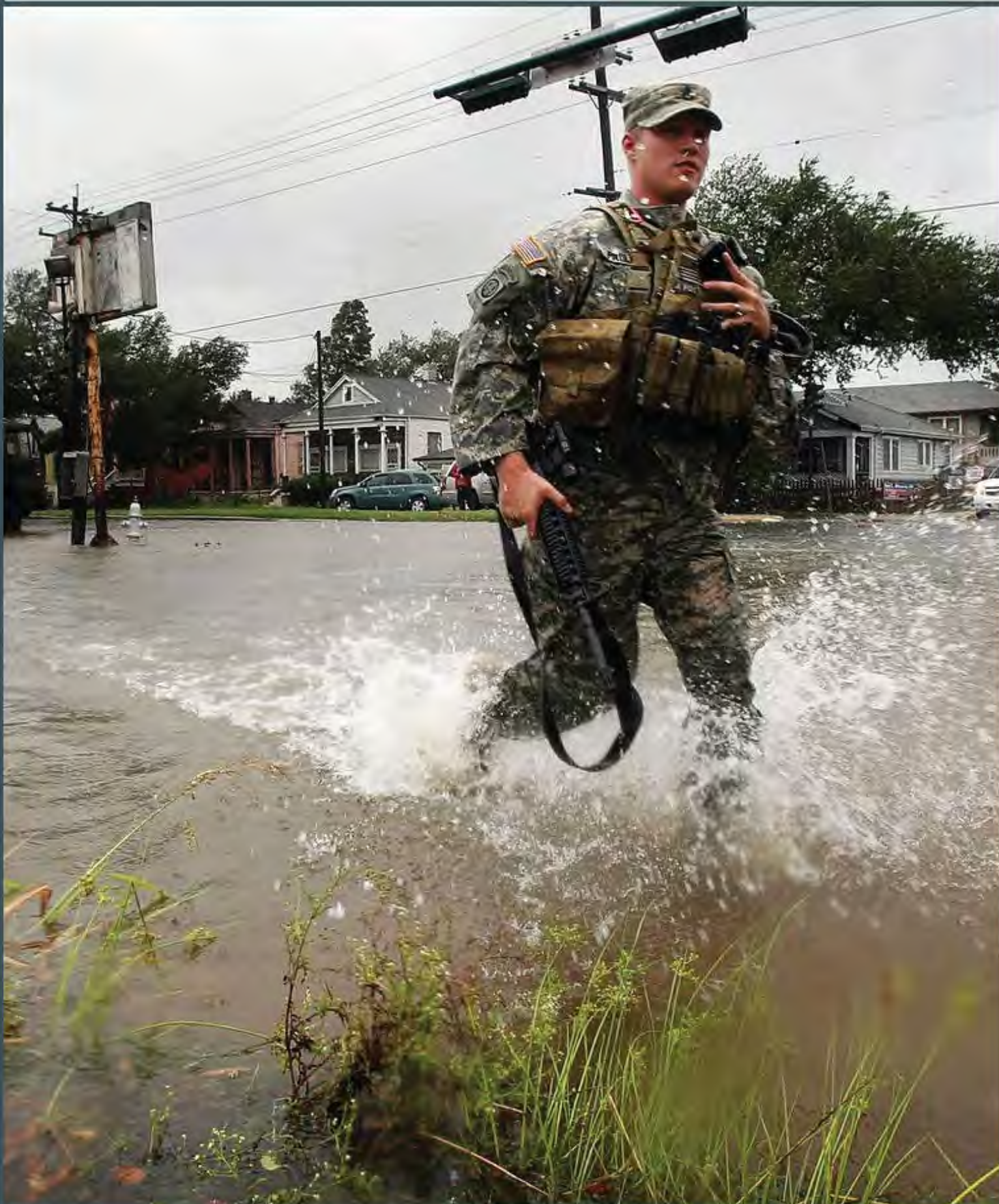
A U.S. Army National Guardsman runs through floodwater from Hurricane Gustav on Sept. 1, 2008, in New Orleans, LA