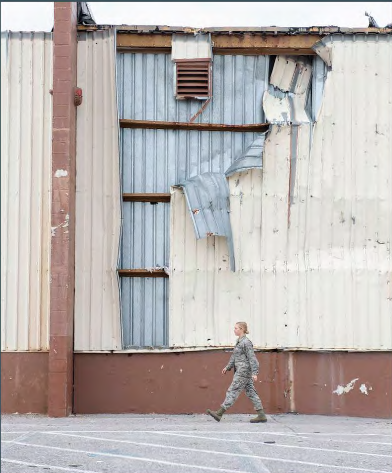
An Airman walks past the 325th Logistics Readiness Squadron materiel management flight warehouse at Tyndall Air Force Base, Florida, which was damaged by Hurricane Michael, March 13, 2019